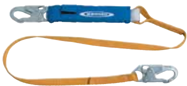
6' TWINLEG C411100