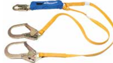
6' TWINLEG C411200