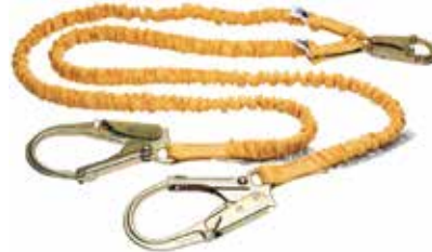
6' SINGLE LEG C351200 Saphook