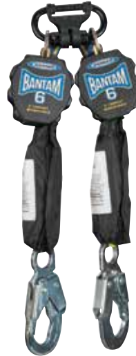
ALUMINUM REBAR R431006-R 5.7 lbs

Dyneema®/Polyester Webbing Impact Resistant Nylon Twinleg Carabiner