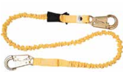
6' SINGLE LEG C351100 Saphook